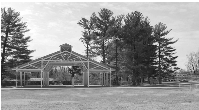
Dypski Pavilion rendering picture near ball field area of the park along Windsor Mill Road

the pavilion takes up a large area of their small space. Several FOGFLP members were initially not in favor of moving the pavilion to GFLP considering its age and appearance. However, after several meetings with Capital and representatives from the sports teams, we supported the placement of the pavilion in the ball field areas, especially for the benefits that it will provide to the sports teams. We have been shown before and after pictures of the pavilion once it is relocated to GFLP. The projected “mock ups” greatly improve the appearance of the pavilion and we hope that the renovations will be satisfactory in the flesh. If you are interested in more information about the Dypski Pavilion and its history, let me know.(mccbrid@gmail.com)