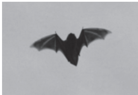
A red bat foraging above Winan's Meadow on a warm December afternoon.

I was pleasantly surprised by my results. There appears to be 6-7 bat species present throughout the Gwynns Falls watershed during the summer. Most sites had 3-5 bat species present, but my Rognel Heights & Leakin Park sites had 6-7 bat species: the big brown bat, red bat, hoary bat, silver-haired bat, tricolored bat, evening bat, and possibly little