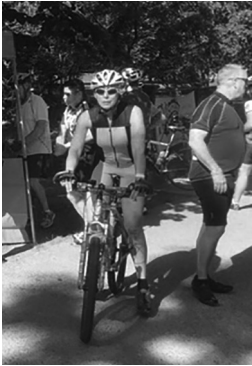
Tour Dem Parks 2017 !

Friends of Gwynns Falls/Leakin Park 1920 Eagle Drive Baltimore, MD 21207 www.friendsofgwynnsfallsleakinpark