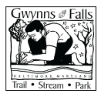
Priends of Gwynns Palla/Leakin Park 1920 Bagle Drive Baltimore, MD 21207 www.friendaufgwynnafallskakinpark