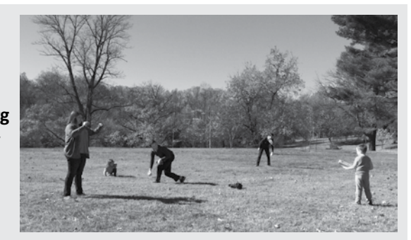
A family enjoys Second Sunday in the Park

Friends of Gwynns Falls/Leakin Park - friendsofgwynnsfallsleakinpark.org Baltimore City Department of Recreation and Parks - bcrp.baltimore.gov Baltimore Bird Club - baltimorebirdclub.org Gwynns Falls Trail - gwynnsfallstrail.org Carrie Murray Nature Center - carriemurraynaturecenter.org Outward Bound - outwardboundbaltimore.org Parks and People Foundation - parksandpeople.org