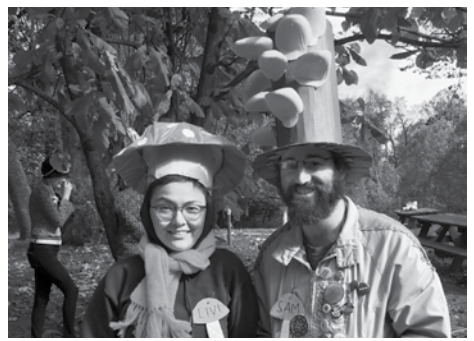
Mushroom Festival enthusiasts. More to come in our next issue.