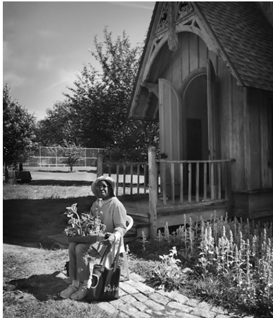
Stopping for a rest at the Herb Festival

Friends of Gwynns Falls/Leakin Park 1920 Eagle Drive Baltimore, MD 21207 www.friendsofgwynnsfallsleakinpark