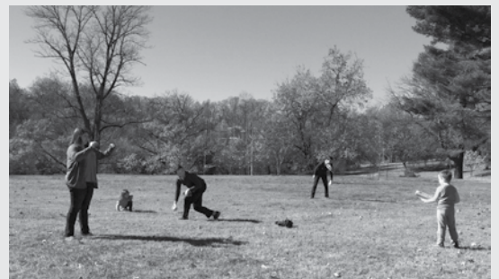
A family enjoys Second Sunday in the Park