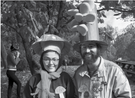
Mushroom Festival enthusiasts. More to come in our next issue.

Friends of Gwynns Falls/Leakin Park 1920 Eagle Drive Baltimore, MD 21207 www.friendsofgwynnsfallsleakinpark